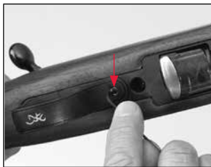
Adjust the trigger using a 1/16" Allen wrench.