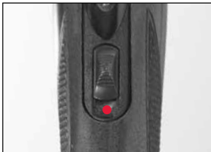
The “safety” shown in the off safe position.