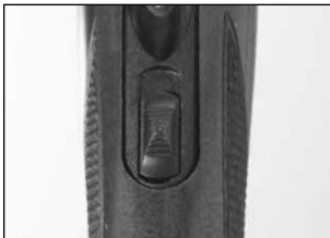
The “safety” shown in the on safe position.