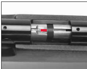
The cocking indicator showing the firing pin is in the cocked position.